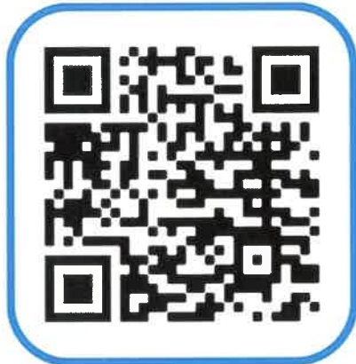
Cuenta tu historia

¡Queremos saber de más miembros de la comunidad en la Región 16! Usa los códigos QR a continuación para participar en un focus group, compartir tu historia familiar, suscribirte a nuestro boletín y unirte a nuestro grupo de Facebook.